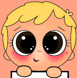
Tabla del 7