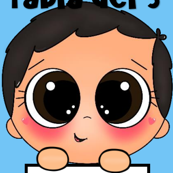
Tabla del 3