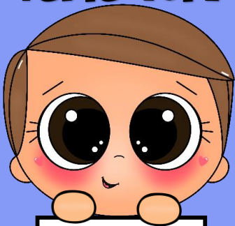
Tabla del 1