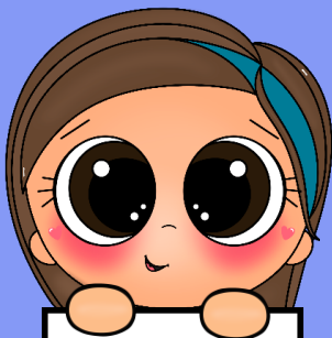
Tabla del 9