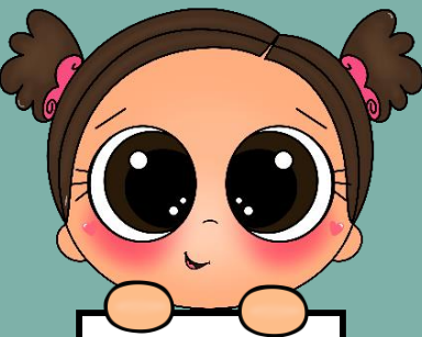
Tabla del 4