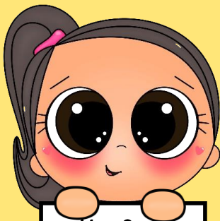
Tabla del 11