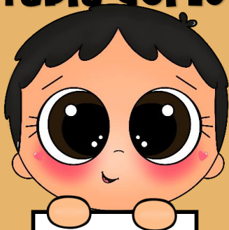
Tabla del 10