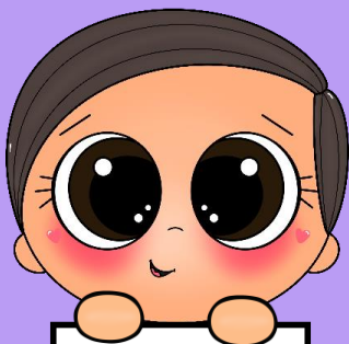
Tabla del 12