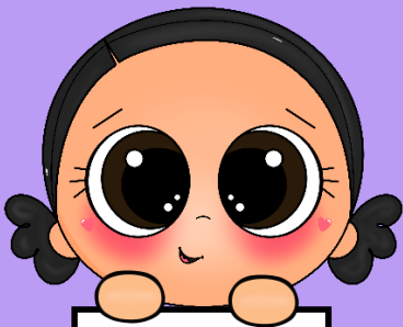
Tabla del 6