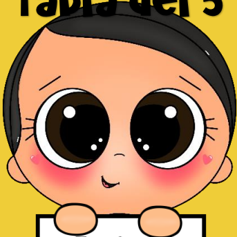
Tabla del 5