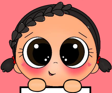
Tabla del 2